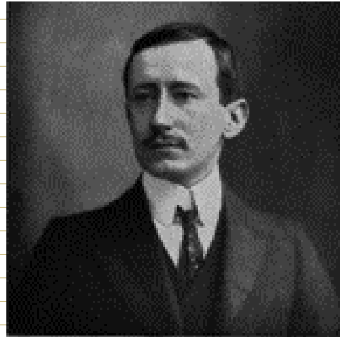
Guglielmo Marconi (1874-1937)