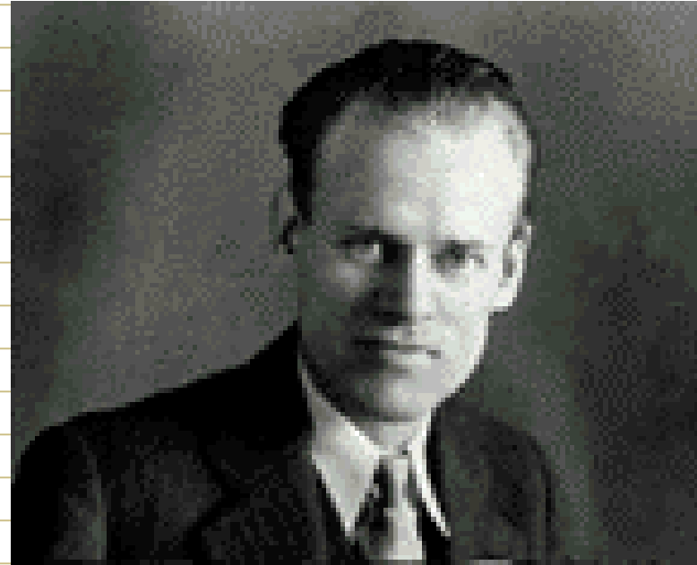
Philo T. Farnsworth (1907-1971)