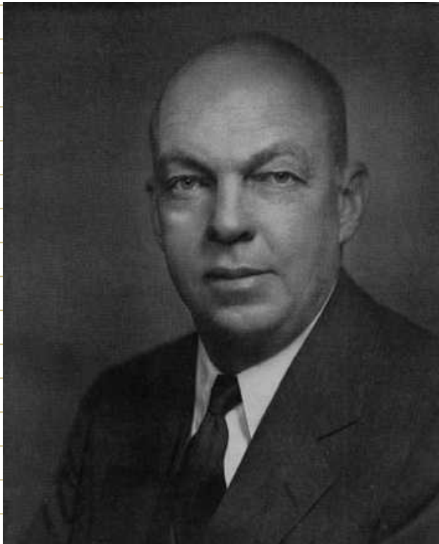
Edwin H. Armstrong (1890-1954)