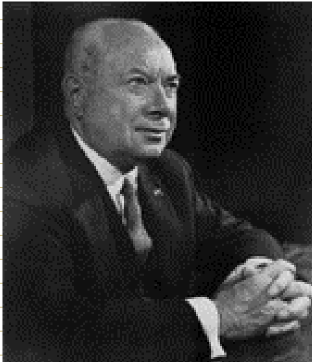
RCA mastermind David Sarnoff