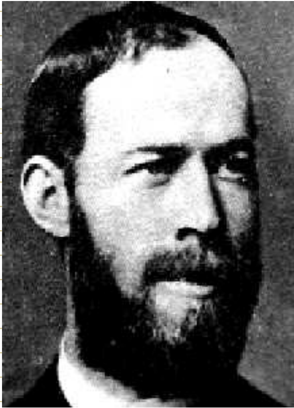
Heinrich Hertz (1857-1894)