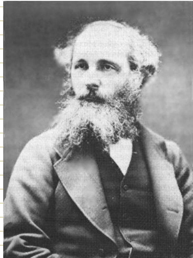
James Clerk Maxwell (1831-1879)