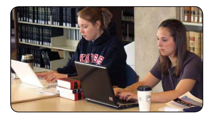
Metajuris, an ITTC-developed search engine, provides a user friendly "one-stop shop" for legal research. KU law students, above, tested the prototype last fall.

The resulting search engine, MetaJuris , simultaneously searches various legal databases for cases, statutes and literature citations. The currently free service is at http://metajuris.ittc.ku.edu/.